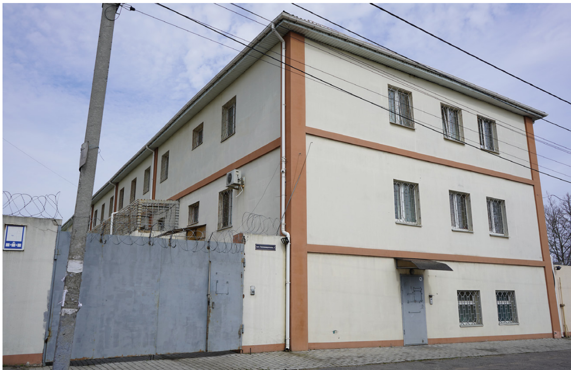
■ Temporary detention center (TDC) No.1 of the Main Department of the National Police in Kherson Region, located at 3 Teploenerhetykiv Street / ZMINA

Over 200 people were held in TDC during the occupation of Kherson. Currently, 40 criminal proceedings have been opened over the unlawful confinement of Ukrainian citizens in TDC, which were later combined into one criminal proceeding, opened on the basis of the elements of crimes provided for in Part. 1, 2 Art. 438 (Violation of laws and customs of war) and Part 7 of Art. 111-1 of the Criminal Code of Ukraine (Collaborationism). The prosecutor's office recognized 21 women 7 as victims and interrogated them. However, Human Rights Centre ZMINA managed to establish that at least thirty women were held in TDC at different times. The women, on whose testimonies the report is based, were detained during the summer – mainly in July-August 2022 and were held until the end of October when Russian troops began to retreat from the right bank of Kherson region.