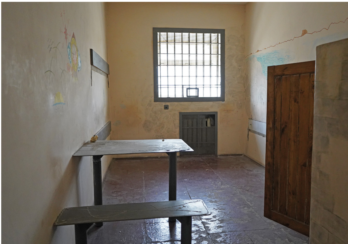
■ One of the cells of the TDC, in which women were kept

In addition, inadequate conditions of confinement of people in places of deprivation of liberty, in particular, a lack of personal space 38 , which is aggravated by other factors: inadequate hygienic and sanitary conditions, insufficient lighting and ventilation, insects and mold in cells, limited access to showers, limited daily walks or their absence, lack of privacy when using the toilet, poor or irregular nutrition, etc. in its entirety may amount to a violation of the right to freedom from torture or other cruel, inhuman or degrading treatment and punishment 39 .