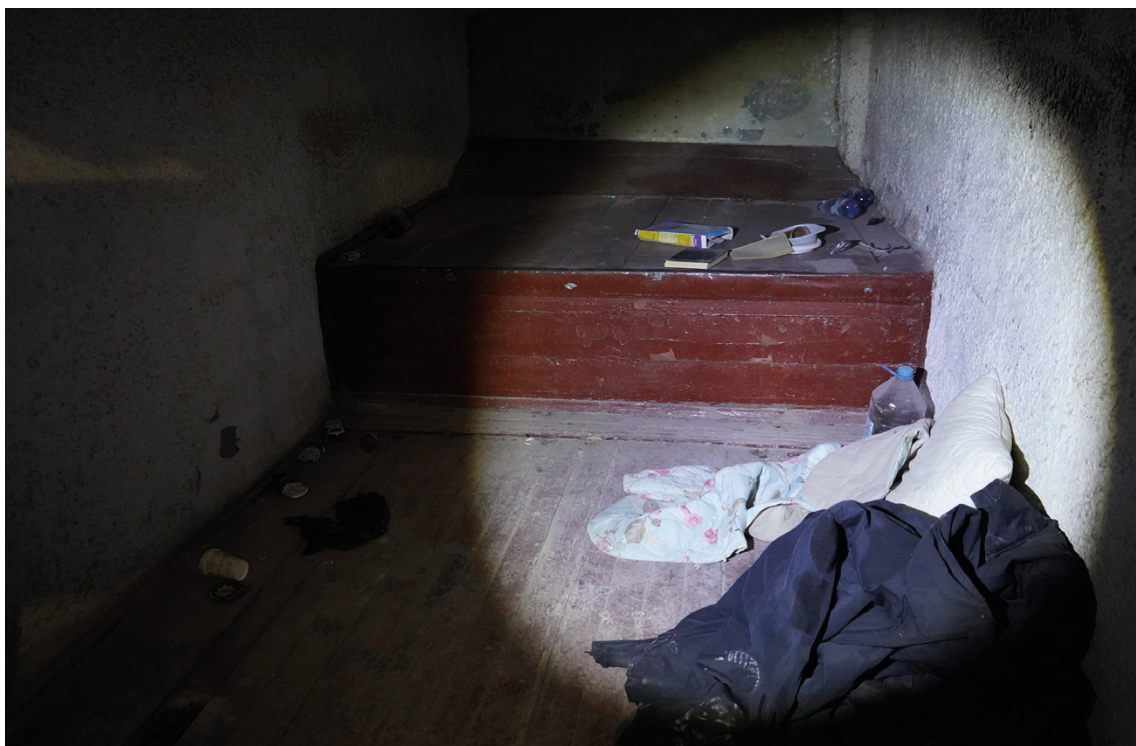
■ One of the cells in which the representatives of the Russian Federation kept people, in the basement of the Main Department of the National Police in Kherson Region (MDNP) at 4 Liuteranska Street

The guards came, they were not pleased, the guys said: "A person is not breathing." They got confused, ran somewhere, probably to get a doctor. When those FSB officers, most likely, were already going downstairs, the rustling of a package was heard, they were dragging the body. 10