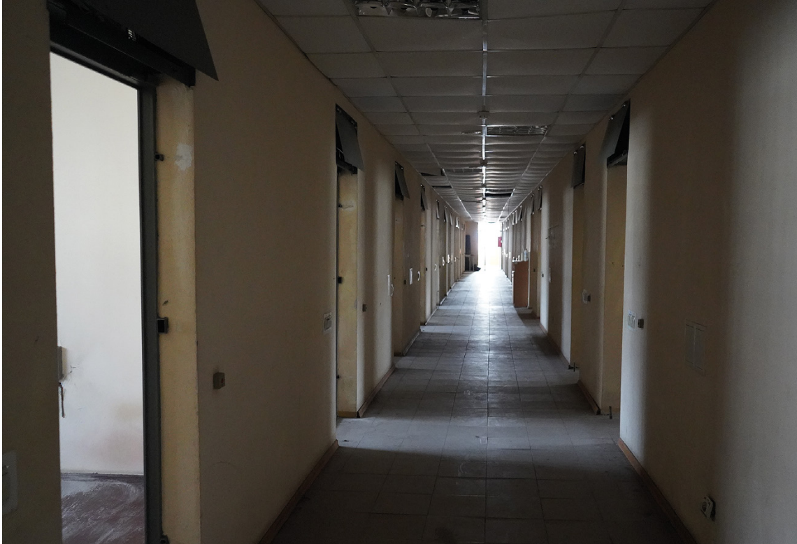
■ The floor with the cells / ZMINA