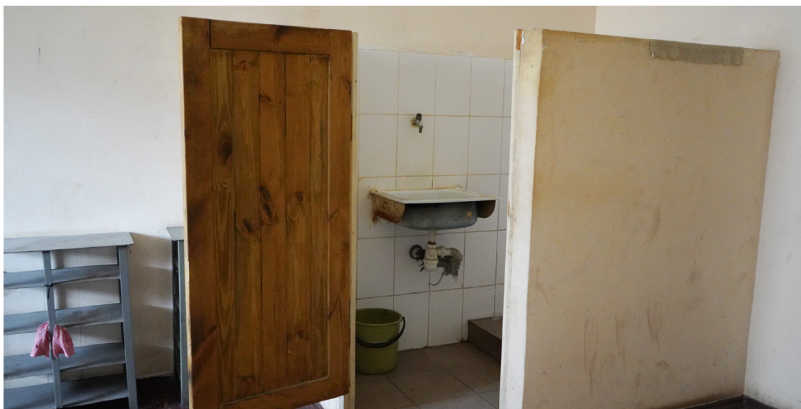
■ Toilet in one of the TDC cells / ZMINA

Hygiene was not properly ensured. In some cells, there was running water in wash basins, women had to wash themselves with water from a wash basin. According to the testimonies, the first time – approximately 21 days – the detainees did not have the opportunity to wash at all 40 . Later, only the women held in TDC began to be taken to the shower, being given five minutes for this. At the same time, these measures were not regular: they were taken to the shower depending on the mood of the senior in TDC – Andrey "Zloy". Women could be taken to shower every day or could not for five days in a row 41 .