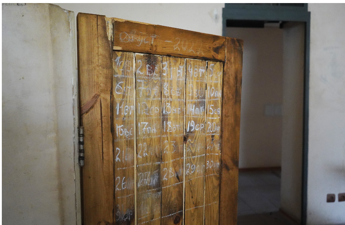
■ Improvised calendar in one of the TDC cells

Two of the interviewees also reported that to release them or their acquaintances, the representatives of RF put forward a condition to appear in a propaganda video 80 . In one case, the text was dictated, in another, they ordered to "apologise to Russia" (a victim, a teacher, had a public conflict with a collaborator) and tell people to send their children to schools in the occupied territories 81 .