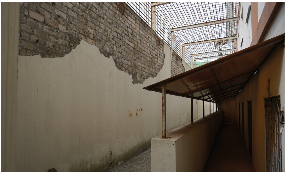
■ Walking yard on the territory of the TDC

We were not very happy with walks because it was another torture. 45